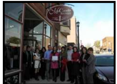
MaCandis Representatives and Chamber Ambassadors