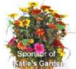
Lawn Mowing & Snow Removal